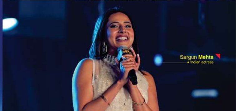
Sargun Mehta • Indian actress