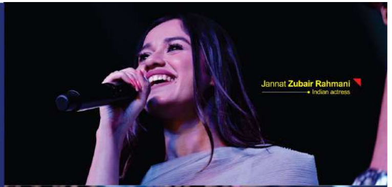
Jannat Zubair Rahmani • Indian actress