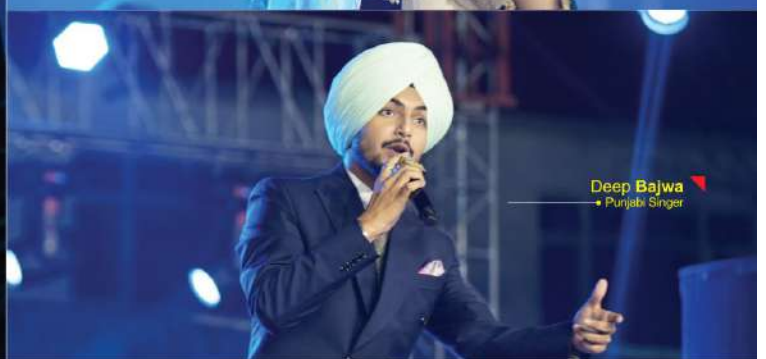
Deep Bajwa • Punjabi Singer