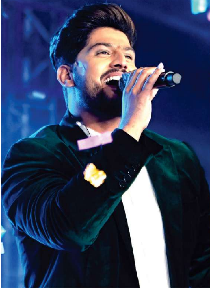
Gurnam Bhullar • Indian Actor & Singer

Every year, the college hosts some of the most renowned Bollywood celebrities and prominent figures from various fields, serving as pillars of inspiration. Join us for this vibrant learning experience, surrounded by sources of inspiration