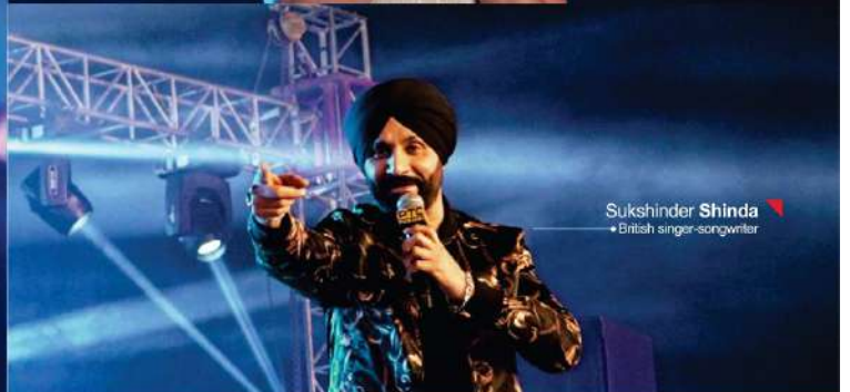
Sukshinder Shinda • British singer-songwriter